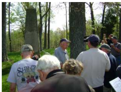
Ed Bearss, noted author, historian and tour guide for Civil War affiliated groups.

Round Table members were complimentary of the MSBA for the interpretation and the upkeep of the battlefield. "Mill Springs was one of the most important battles of the early part of the Civil War," said Bearss, "It was the first