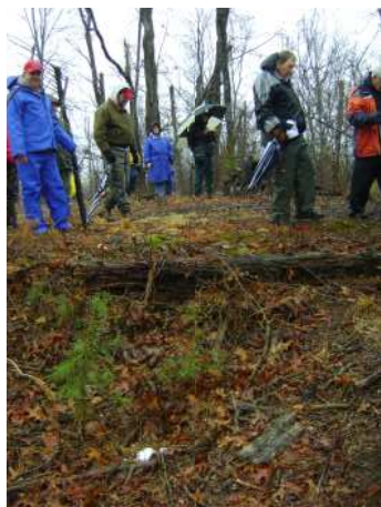
CWFSG explores the fortification sites at Beech Grove.